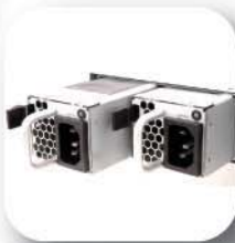
Redundant 1+1 PSU