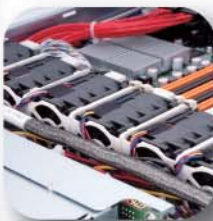
Up to 6 x middle 40 mm fans