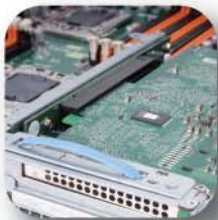
Easy-assembly PCI riser bracket